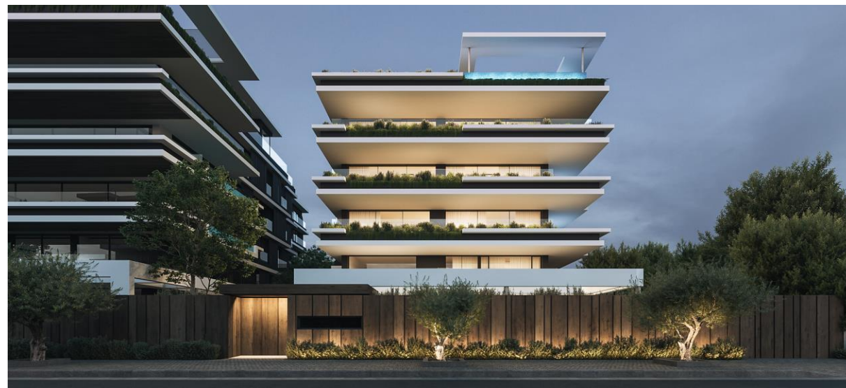
Nireos 53, Voula