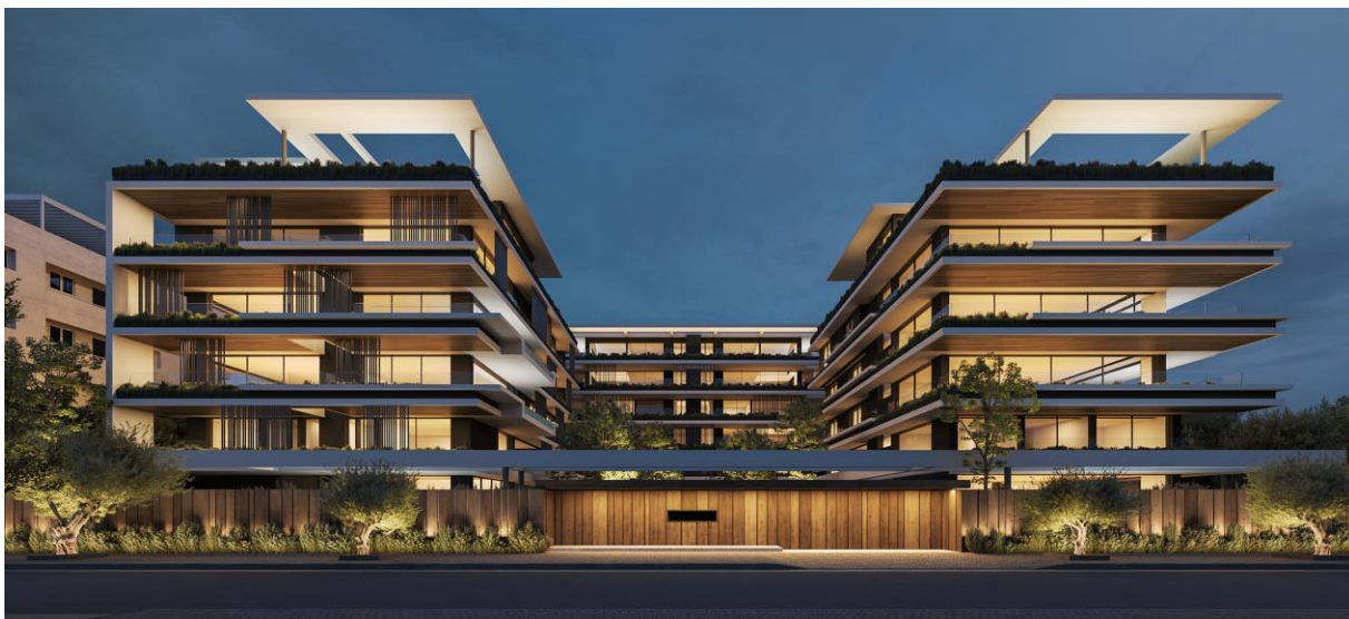
Nireos 47-51, Voula