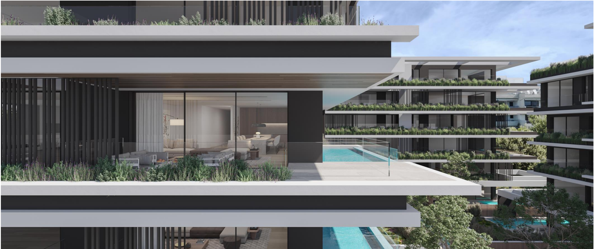
Nireos 47-51, Voula